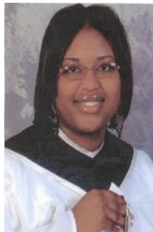
Past Scholarship Recipient and College Tour Participant